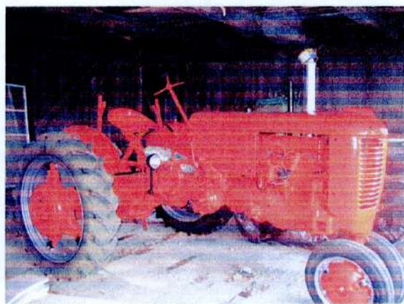
1945 Case Tractor from Waln Family Photo Clifford Reed

Sunday, June 14 - Last viewing of "Women's Crafts" exhibit. See Feb. 8 for description.