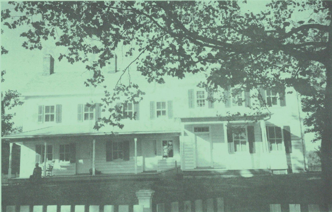
The 1790s-1830 Schenck House, Southfield Road, headquarters of the HS of WW.